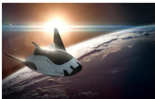
Dream Chaser Spaceplane

Japan Airlines Co., Ltd., Kanematsu Corporation, Oita Prefecture, MUFG Bank, Ltd., Tokio Marine & Nichido Fire Insurance Co., Ltd., Sierra Space Corporation, and Space Port Japan Association have been participating in a partnership to explore the use of the Dream Chaser ® spaceplane and are working together to utilize Oita Airport as an Asian base for the Dream Chaser spaceplane.