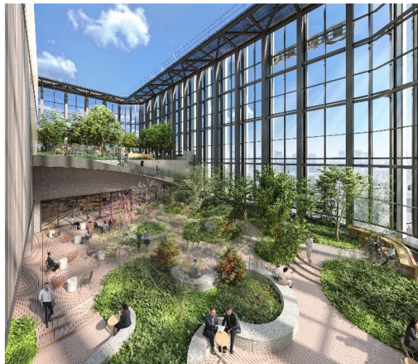
27th and 28th floors: Rooftop terrace and lounge