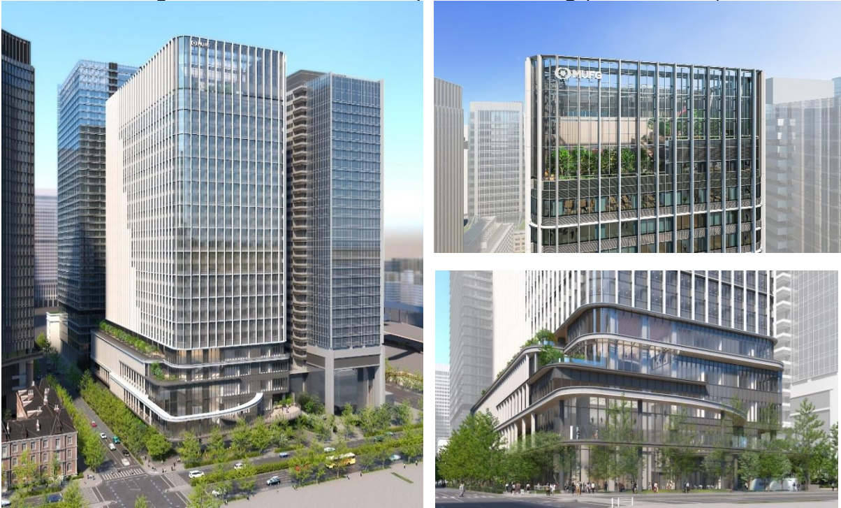
Artist’s rendering of the new MUFG Headquarters Building (exterior view)

The lower floors will feature indoor and outdoor plazas and passageways, aerial walkways and open terraces, designed to create a lively atmosphere by interconnecting with the surrounding city streets.